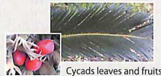
Cycads leaves and fruits