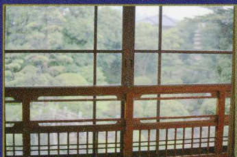
View of the garden from Byakuren's living room