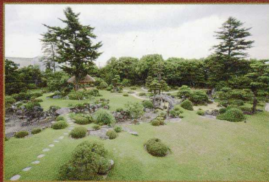
Place of Scenic Beauty Garden of Den-emon Ito's Former Residence

Former Den-emon Ito Residence Parking Lot, Kobukuro Research Park Parking Lot Free of charge