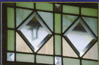
Stained glass window of the reception room

The mansion was built along the Nagasaki Kaido (Highway) as the main residence of Chikuhō's Coal Tycoon Den-emon Ito. The premises has four residence buildings, three mud-walled storehouses, a gate with a garage and the gatekeeper's room attached to it, a students living quarters, an office building and a huge stroll garden with a pond. The residence combines what is best about Japanese architecture and Western Modernism. It demonstrates high levels of architectural techniques and features meticulous and elegant decorations, attracting visitors with its exquisite balance between Japanese and Western beauty. Den-emon and his second wife Byakuren Yanagihara spent almost 10 years here together. Visitors are strongly reminded of the two personas. Take time and stroll around the important heritage and listen to the voices of Den-emon and others who lived the history of Chikuhō's coal industry.