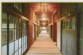
West Wing/North Wing Corridor